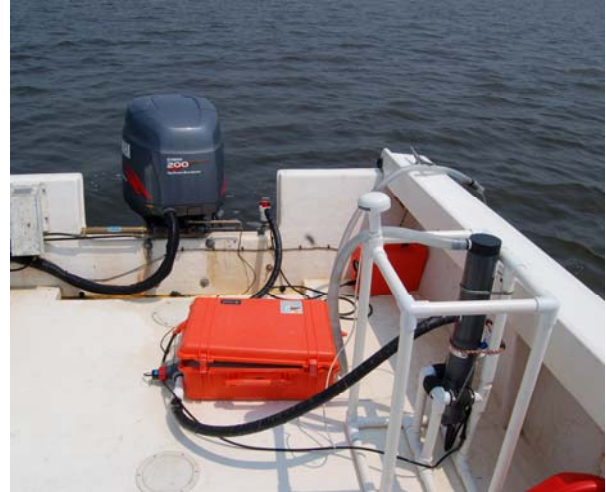
CBL Dataflow system aboard vessel.

chlorophyll- a concentration). Position and depth are provided by a combination GPS and depth sounder, providing positional accuracy to within 1-3 meters. These values are compiled and logged automatically by a rugged computer. The vessel travels at approximately 20 knots, or 10 meters per second.